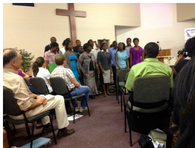
2013 Sola 5 Conference

Numerous mission efforts from all over southern Africa were reported on, including ACU. Also, groups from various churches and countries blessed the attendees with local renditions of songs and hymns. The food was delicious, the fellowship was sweet, and the Spirit blessed the hearts and instructed the minds of those who were privileged to attend.