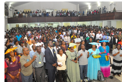
2013 Reformed Family Conference