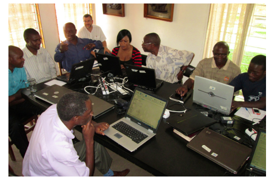
Ten3 Computer Training Outreach

The students will be taught computer skills: typing, word processing, spreadsheet essentials, internet safety, graphics, presentations and basic web design. These provide essential life skills and ensure the students are well prepared to use technology in a godly way, whether they