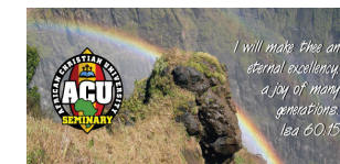
August Prayer Update

Formatted to print 2-sided, A4 paper, fold, over as booklet.