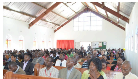
Emmasdale Baptist Congregation