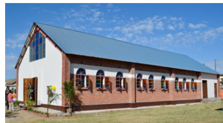
Emmasdale Baptist Church

African Christians have not reached their full potential, due in part to the lack of Biblically robust Christian higher education.