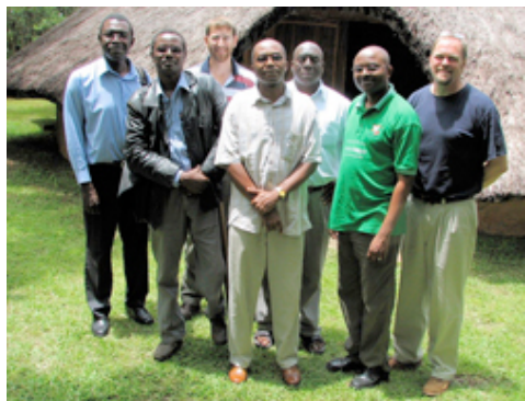
ACU Strategic Planning Meeting