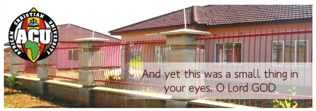
"Who am I, O Lord GOD, and what is my house, that you have brought me thus far? And yet this was a small thing in your eyes, O Lord GOD." (2 Samuel 7:18-19)

While we strive to accomplish our plans. God ordains His purpose with ease at the appropriate time. Praise God with us for His blessed provision of the "ACU Offices" at the appropriate time. A small thing for God, but a significant step forward for ACU!